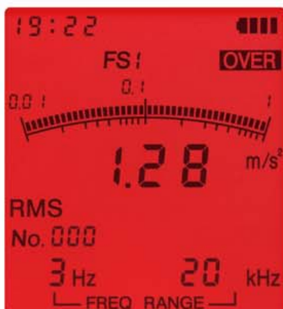
Overload indication screen