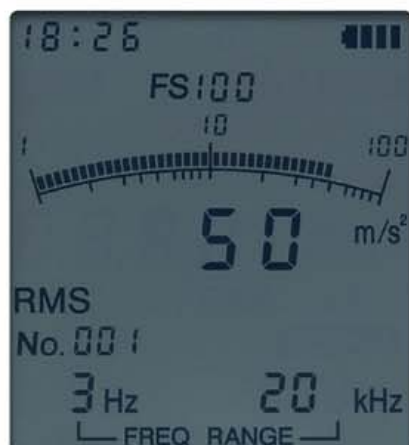
Measurement data display screen

The large LCD panel displays the bar graph meter and numeric reading at the same time, making it easy to visually evaluate any changes immediately. The display also shows the frequency range setting and other useful information. Backlighting can be turned on if required, allowing use of the unit also in dark locations. In case of overload, the indication "OVER" appears, and the entire display color changes to red.